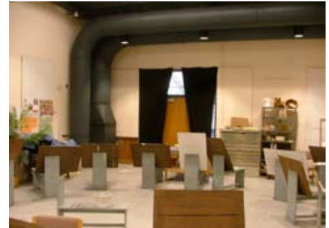
The current Drawing Studio will become the NCAT's primary electronic classroom.

Several special events are in the works to celebrate the opening of the NCAT. Watch for more information about these events in the coming months. ♦