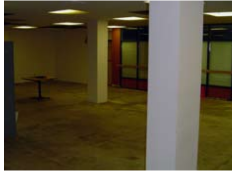
It doesn't look like much now, but this space will house the main NCAT lab and project studios.

Phase II of the Arts Renovation Project is on schedule to begin May 17. This phase includes construction of the NCAT, as well as the construction of the new Photography Studio and the installation of a new elevator in Noble Center. The noisiest and messiest parts of the process should be completed by the start of the fall semester, and parts of the Noble Center will be open in the fall as the work continues.