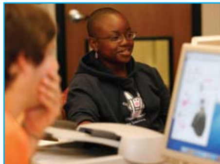
Students at work in the NCAT Lab on a variety of digital media assignments.